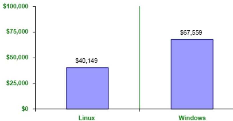
Overall TCO by Environment

Although Windows offers considerable savings in terms of staff training costs, many analysts feel that the total cost of ownership of a Linux server is up to 40% lower. 10 This is a significant deterrent to any company large enough to maintain on-site IT trained in the operation of Linux servers.