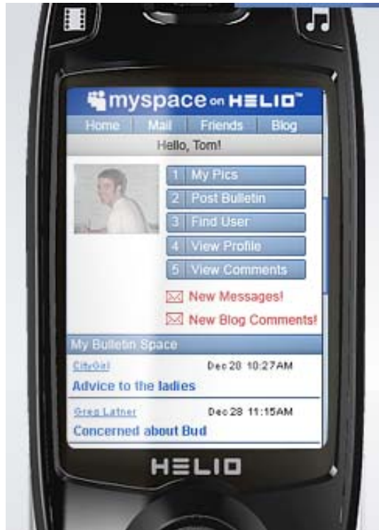
Figure 1: MySpace Mobile on Helio