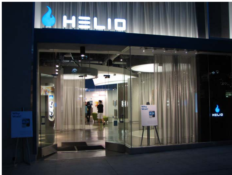
Figure 2: Helio Santa Monica Store Front