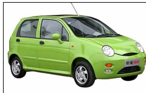
2004 Chery QQ