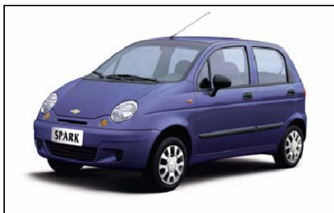
2005 Chevrolet Spark