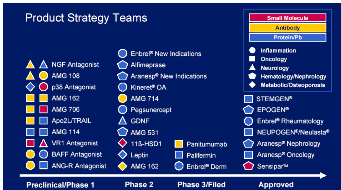
Exhibition 3. Amgen's product strategy teams.

drug using this molecule. P38, an enzyme, was believed to be responsible for touching off several inflammatory signals. J&J acquired Scio Inc., a small company that had a P38 drug in Phase 2 of clinical trial, with $2.4 billion last year, expecting to replace Amgen's next blockbuster Enbrel with a more powerful P38 drug. On the Research and Development day, in order to protect Enbrel, Amgen revealed that its own P38 drug had completed Phase 1 trial. Even though it was well behind J&J, it sent a signal that it was ready to compete, and that Amgen thought it might have a chance to catch up with J&J. In addition, it was possible that Amgen aimed at developing a better P38 drug with fewer side effects and more functions instead of focusing on the progress alone. The strong reaction from Amgen also showed its fighting spirit to maintain the advantages it had earned in certain area.